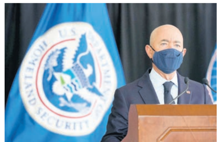
Secretary of Homeland Security Alejandro Mayorkas speaks about aviation security ahead of the summer travel season during a news conference at Ronald Reagan Washington National Airport, Tuesday, May 25, 2021, in Arlington, Va.

The administration has largely kept in place pandemic-related powers introduced by President Donald Trump in March 2020 to expel people to Mexico without an opportunity to